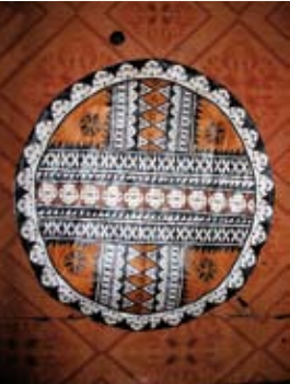
Fijian tapa cloth. © SPC

Festival of the Arts in Palau in 2004, Bangou tribe, New Caledonia. © Martial Dosdane