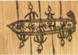
Ship represented on carved bamboo.