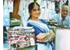
In Suva, the capital of Fiji, Melanesians and Indo-Fijians live side by side.