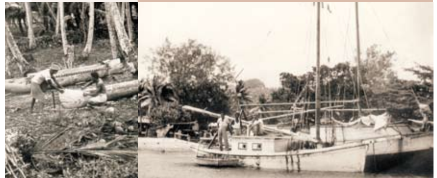
The riches of the Melanesian islands attracted a number of European adventurers and merchants.

These “pirates of the shore” may have been shipwrecked Europeans – the first among them were reported in Palau in 1684 – former sailors who had sometimes deserted their crew, or fugitive convicts, who sought refuge on an island and were submitted to the authority of a chief. These men, well integrated into the local populations, often played an intermediary role between the Oceanic peoples and European merchants.