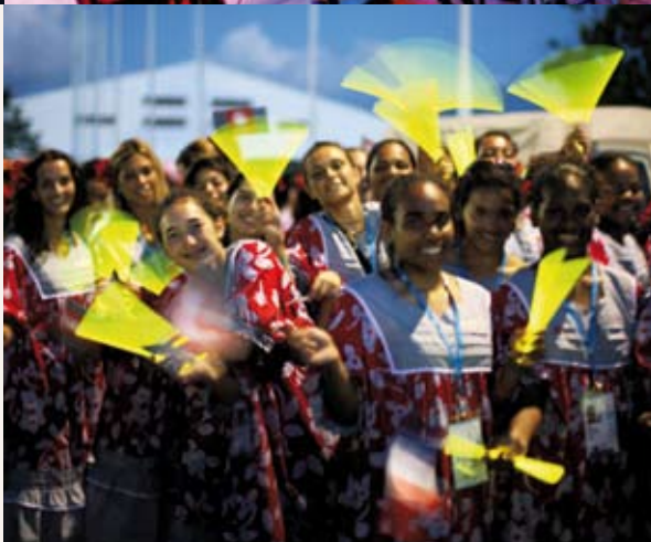
Festival of Melanesian Arts in Palau, 2004.