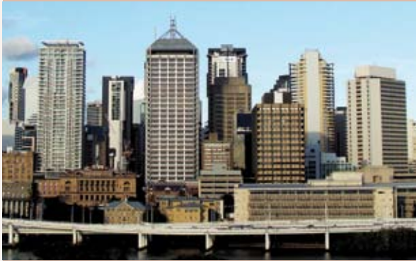
Towers in Sydney.

The Pacific Regional Environment Programme (SPREP) is an intergovernmental organisation in charge of promoting cooperation, helping Oceanic countries and territories to sustainably manage their island resources and marine ecosystems and to confront the threats and pressures that affect island and marine systems. The SPREP has 25 members, including 21 Pacific island countries and territories and four developed countries with direct interests in the region (Australia, New Zealand, the United States and France).