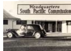
The Pentagon's headquarters in Noumea during World War Two became the head office of the Secretariat of the South Pacific Commission (SPC). Photo taken in 1951.

In the post-war period, the defence of the Pacific Ocean was an essential strategic factor at a time when the Cold War was commencing in Asia. Australia, shaken by the threat that Japan had brought to bear, sought to guard against any new attacks from the Asian continent. In its concern for its security, Australia sought to make Oceania a protective buffer zone and considered New Caledonia to be of vital importance in this venture. Thenceforth, Australia sought to affirm itself as a fully-fledged player on the regional and international scene. In this context, it approached the United States and in 1951, Washington, Canberra and Wellington signed the ANZUS military pact. The South Pacific was used as an atomic testing site for the United States, Great Britain and France, and thus became a strategic region.