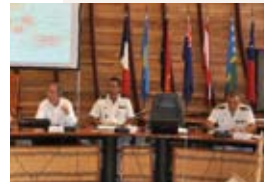
Meeting with the military cooperation leaders in Noumea.

In accordance with a deliberation dating from 1997, a doctor can request the medical evacuation of a New Caledonian patient to Australia, or to Metropolitan France, when the diagnostic, the treatment or the therapeutic monitoring are not able to be performed in New Caledonia, due to a lack of infrastructure, services or local skills adapted to the pathology. There are estimated to be 1 300 medical evacuations per year.