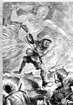
Poster encouraging Maori to enlist in World War One, drawing by William Blomfield published in the New Zealand Observer, December 1915.

The two World Wars enlisted Oceania in the international struggle and the islands sent men to fight in the major battlefields. While the Pacific was not a zone of conflict during World War One, this war still had a strong impact on the region: Germany lost its colonies to Great Britain, Australia and New Zealand but also Japan, which imposed itself as a colonial power in Micronesia.