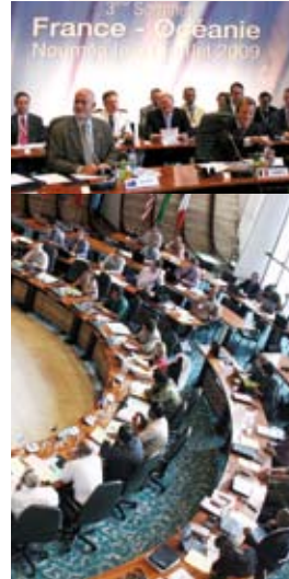
3 rd France-Oceania summit, July 2009.

The Melanesian States express a more radical point of view than most of their Polynesian neighbours on questions relating to New Caledonia and Irian Jaya (the Indonesian part of Papua New Guinea, annexed in 1969). In 1986, they joined forces to form The Melanesian Spearhead Group , which develops a more pro-Third World and anticolonialist discourse than that of the Forum.