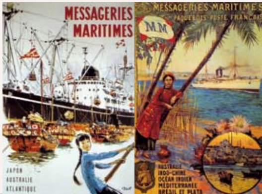
Messageries Maritimes played an important role in connecting the islands with the rest of the world.

The colonisation of the Pacific Islands was accompanied by the development of speculative agriculture, stimulated by the Western markets' need for tropical products, which firmly established the Pacific Islands in a globalised economy. The development of plantations required land and was often associated with land deprivation. Thus, in New Caledonia, measures for the spoliation of Kanak land were engaged as of 1855 on Grande Terre, then extended by the establishment of the reserves system and the application of the Régime de l'Indigénat (Indigenoussness Code) from 1887 to 1946.