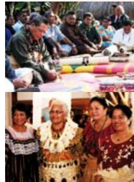
Traditional ceremony from Wallis and Futuna at the Tjibaou Cultural Centre.

According to the 2009 census, Wallisians and Futunians represent 8.7% (21 300 people) of the whole New Caledonian population, and there are only 13 500 remaining on their native archipelago. The migratory movement began in 1852, with the arrival of the first Polynesian workers, hired under contract to agricultural domains. It continued in the early 20th century with the exploitation of nickel mines. In the wake of World War Two, the abolition of the Indigenes Code rarefied the available workforce in New Caledonia. Recruiters therefore rushed to Wallis and Futuna to negotiate the migration of volunteers with the customary authorities, whose consent was indispensable. They were employed in agricultural domains, mines and later, in the construction of infrastructure, such as the Yaté dam – destined to supply electricity to the SLN's metallurgy factory. They were also hired for construction work at the time of the nickel boom in the late 1960s.