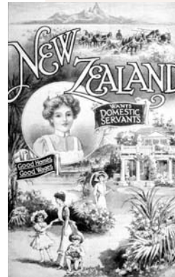
Advertisement to promote the arrival of servants in New Zealand, 1912.

New Caledonia, which also had a need for plantation workers and miners in the 1890s, opened up in its turn to Asian workers: mainly Javanese, Tonkinese and Japanese. The establishment of white settlers and that of a (temporary or permanent) foreign workforce therefore laid the foundations for a multiethnic society.